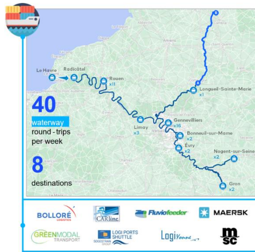
Caption: HAROPA PORT's increasing modal shift. High resolution pictures via this link.